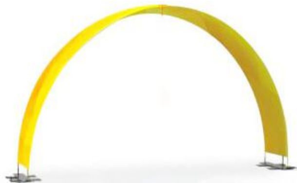
Final Display Result